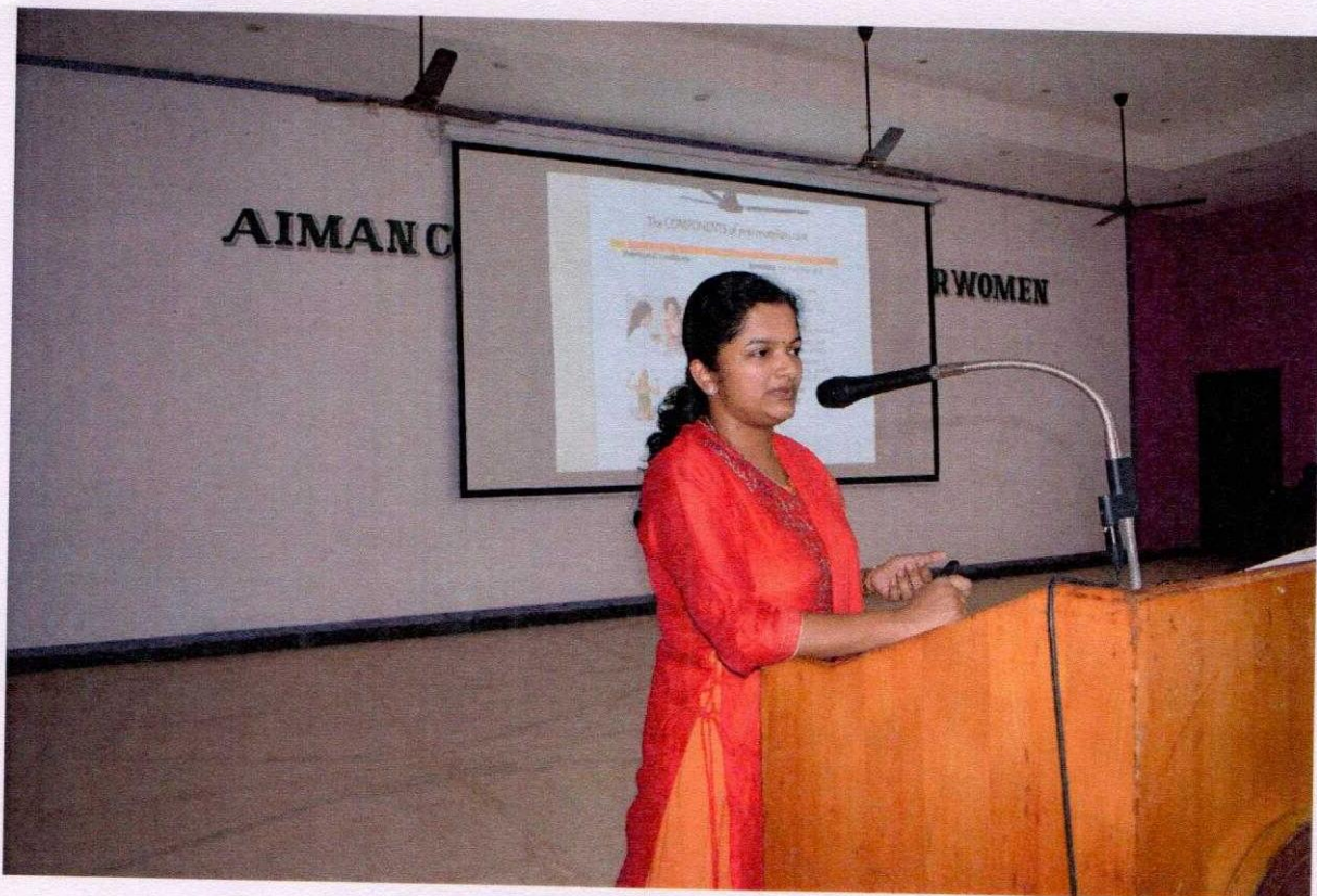
CHIEF GUEST OF THE PROGRAMME