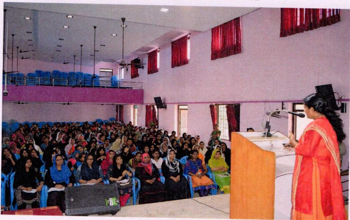
CHIEF GUEST WAS SPEAKING